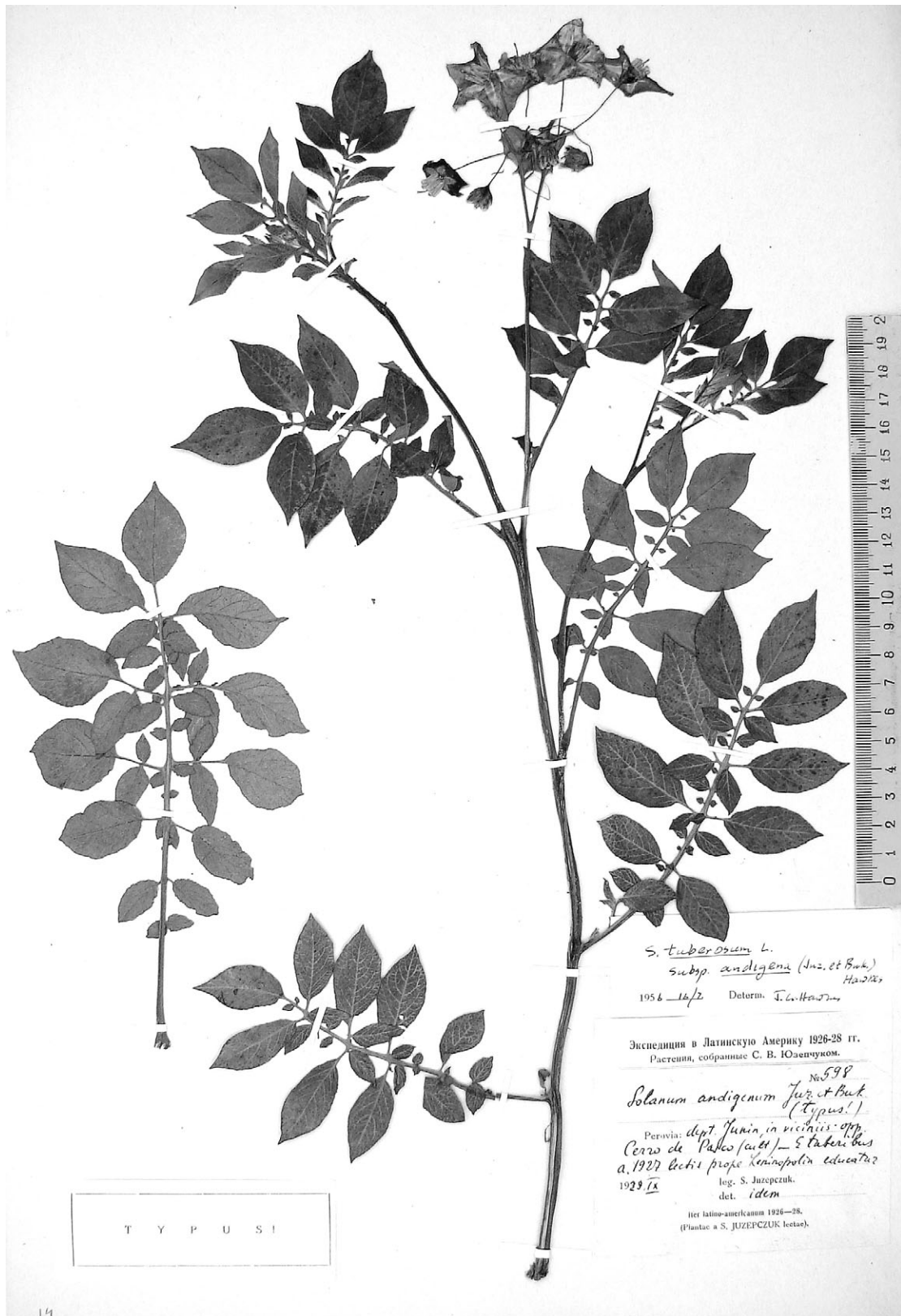
Figure 5. Lectotype specimen of Solanum andigenum Juz. & Bukasov ( Solanum tuberosum L. Andigenum group) held in LE.